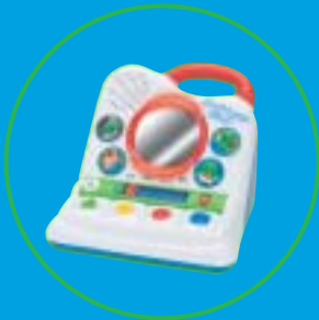
See & Learn™ Piano 6 Months & up