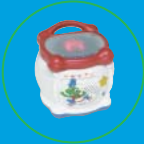
Learning Drum™ 6 Months & up