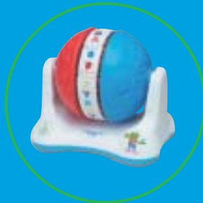
Discovery Ball 6 Months & up