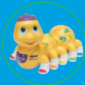
Counting Pal™ 12 Months & up