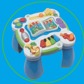
LeapStart™ Learning Table 6 months and up