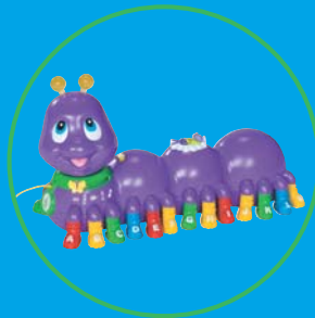
Alphabet Pal™ 12 months and up