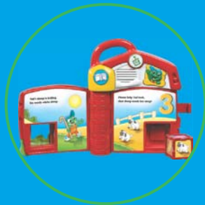
StoryBlock™ Book Tad's Counting Farm 9 months and up