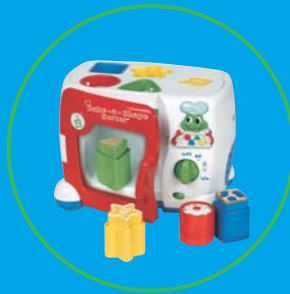
Bake-a-Shape™ Sorter 6 months and up