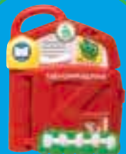
StoryBlock™ Book 9 months +