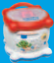
Learning Drum 6 months +