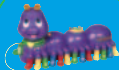
Alphabet Pal™ 12 months +