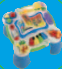
LeapStart™ Learning Table 6 months +