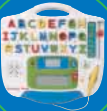
Phonics Writing Desk™ 4+ years