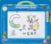
Imagination Desk™ Learning Activity Center 3+ years