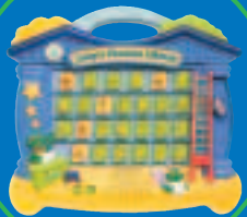
Leap's Phonics™ Library 3+ years