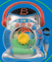
Learning Screen™ Karaoke 4+ years